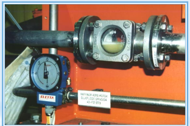
The differential pressure principle, well suited for measuring flows of both oil and water was a further advantage for Eletta.

Reliability: Having supplied Hallstavik paper mill since the 1960's Eletta's reputation as a supplier of extremely durable and reliable equipment is rock solid.