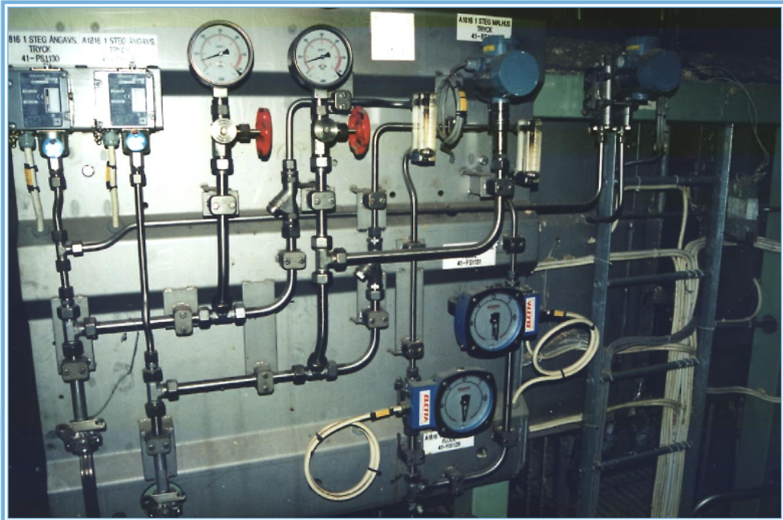
The Eletta Flow monitors are used for measuring the supply of flush water as well as unbricating oil.